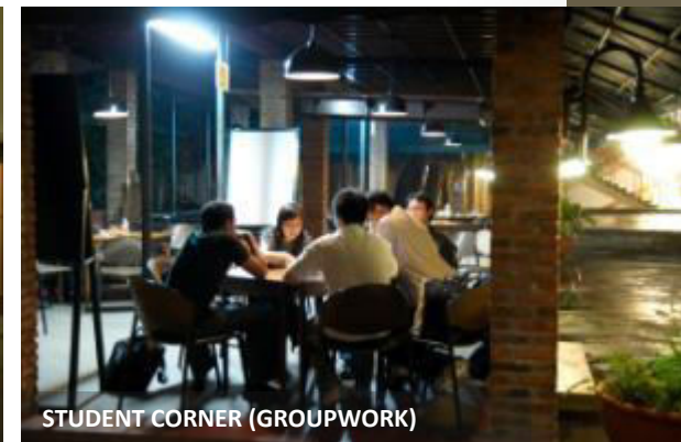
STUDENT CORNER (GROUPWORK)