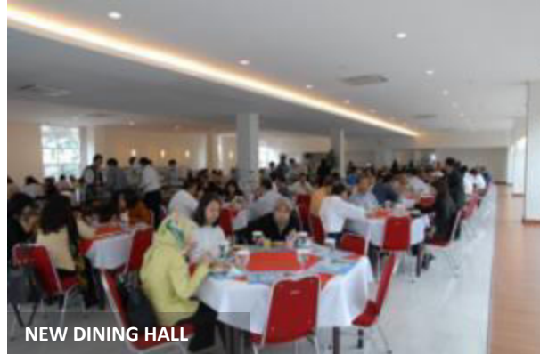
NEW DINING HALL