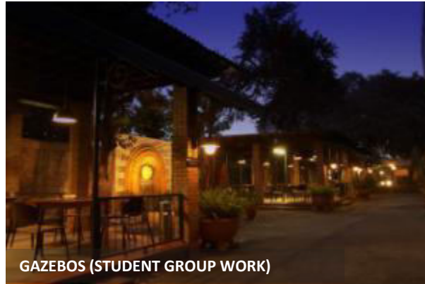
GAZEBOS (STUDENT GROUP WORK)