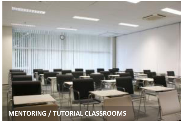
MENTORING / TUTORIAL CLASSROOMS