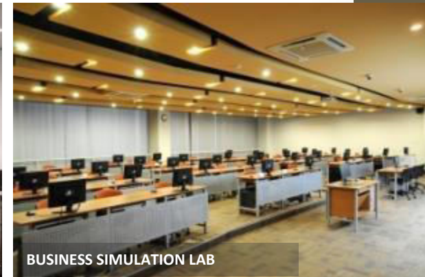
BUSINESS SIMULATION LAB