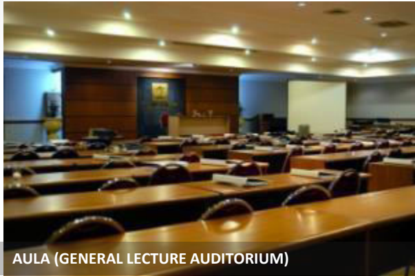
AULA (GENERAL LECTURE AUDITORIUM)