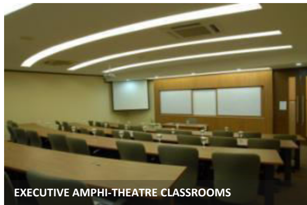
EXECUTIVE AMPHI-THEATRE CLASSROOMS