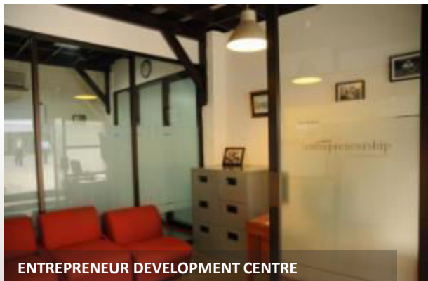
ENTREPRENEUR DEVELOPMENT CENTRE