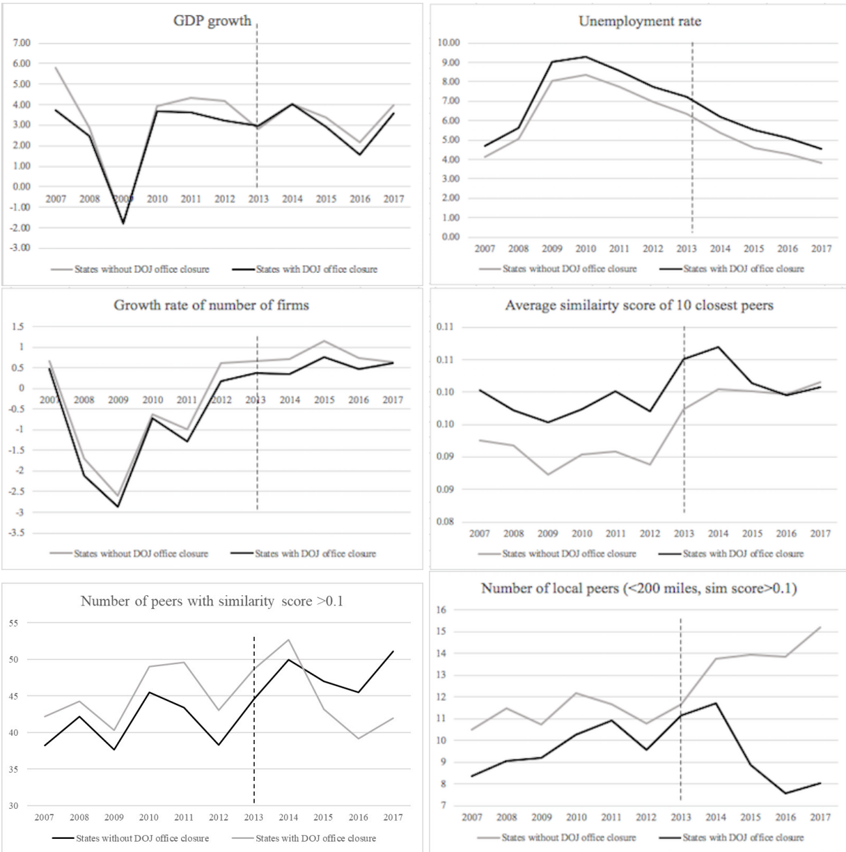
Figure IA1: Economic trends of the treated and untreated states

Notes: These figures show the trends of economic and competition conditions of the affected and unaffected states. The affected states are the ones that experienced the closure of DoJ field offices, and the unaffected states are the other states. We leave out the two states that were covered by two field offices. The first three graphs show the average state-level GDP growth rate, unemployment rate, and net growth of the number of firms, respectively. The next three graphs show the following metrics constructed using the Hoberg-Phillips product similarity scores. For each firm, we calculate 1) the average similarity score of the 10 closest peers, 2) the number of peers with similarity scores exceeding 0.1, and 3) the number of local peers (headquartered within 200 miles) with similarity score exceeding 0.1. The graphs plot the mean value of each metric within a year and affected or unaffected states.