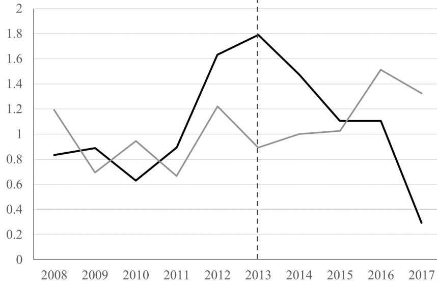
Figure 1: Number of antitrust case filings

Notes: This figure shows the number of antitrust case filings separately for the state courts where the field offices were closed over the period from 2008 to 2017 (dark grey line) and the state courts where the field offices were not closed over the same time period (light grey line). In 2013, DoJ closed down four of its seven regional offices (Atlanta, Cleveland, Dallas, and Philadelphia) that dealt with the antitrust enforcement. The change in coverage affected 23 states and territories: Alabama, Arkansas, Delaware, Florida, Georgia, Kentucky, Louisiana, Maryland, Michigan (Eastern judicial district), Mississippi, New Jersey (Southern part), New Mexico, North Carolina, Ohio, Oklahoma, Pennsylvania, Puerto Rico, South Carolina, Tennessee, Texas, Virginia, West Virginia, and U.S. Virgin Islands.