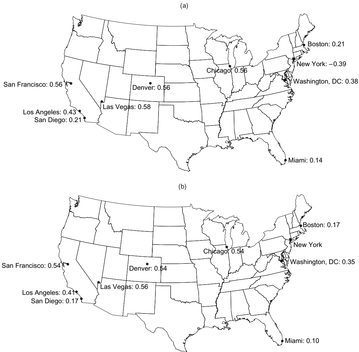
Figure 3. (a) Adjusted R^2 of Fitting the Three-Factor Model (34) with the S-APT Zero-Intercept Constraint \bar{\alpha}_0 = 0 to the 10 CSI Indices Futures Returns; (b) Adjusted R^2 of the Same Model Fitting as in (a), Except That New York Is Excluded from the Analysis

Note. In the model fitting, W is specified using driving distances.