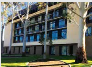
St Thomas More College stmc.uwa.edu.au