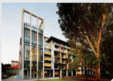
University Hall unihall.uwa.edu.au